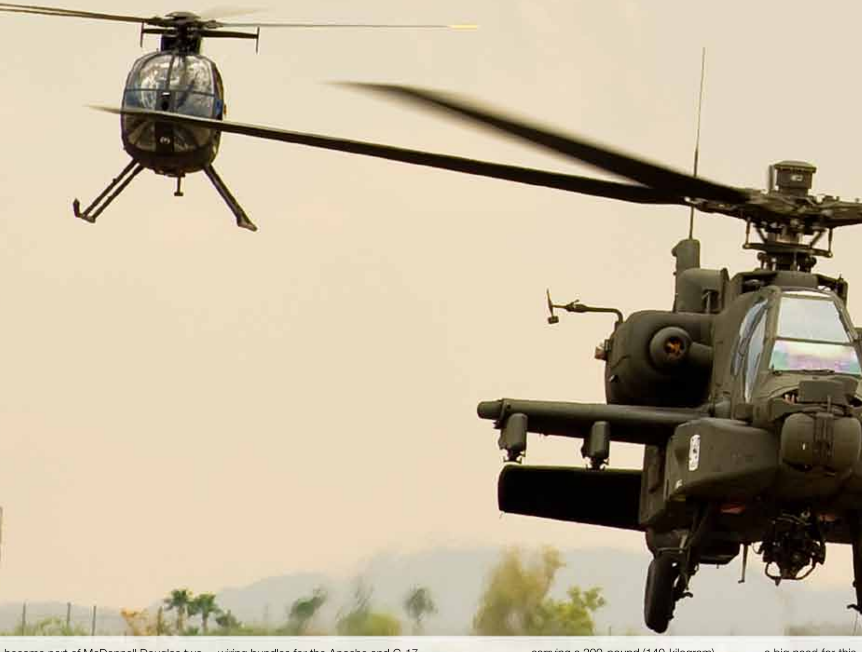
PHOTO: An Apache Block III test helicopter (foreground) and an H-6U helicopter prepare to land at Boeing Mesa.

site became part of McDonnell Douglas two years later-and has assembled Apache helicopters ever since. In addition to building new Apaches, the site remanufactures earlier models into the latest version. rebuilding the aircraft from the inside out.