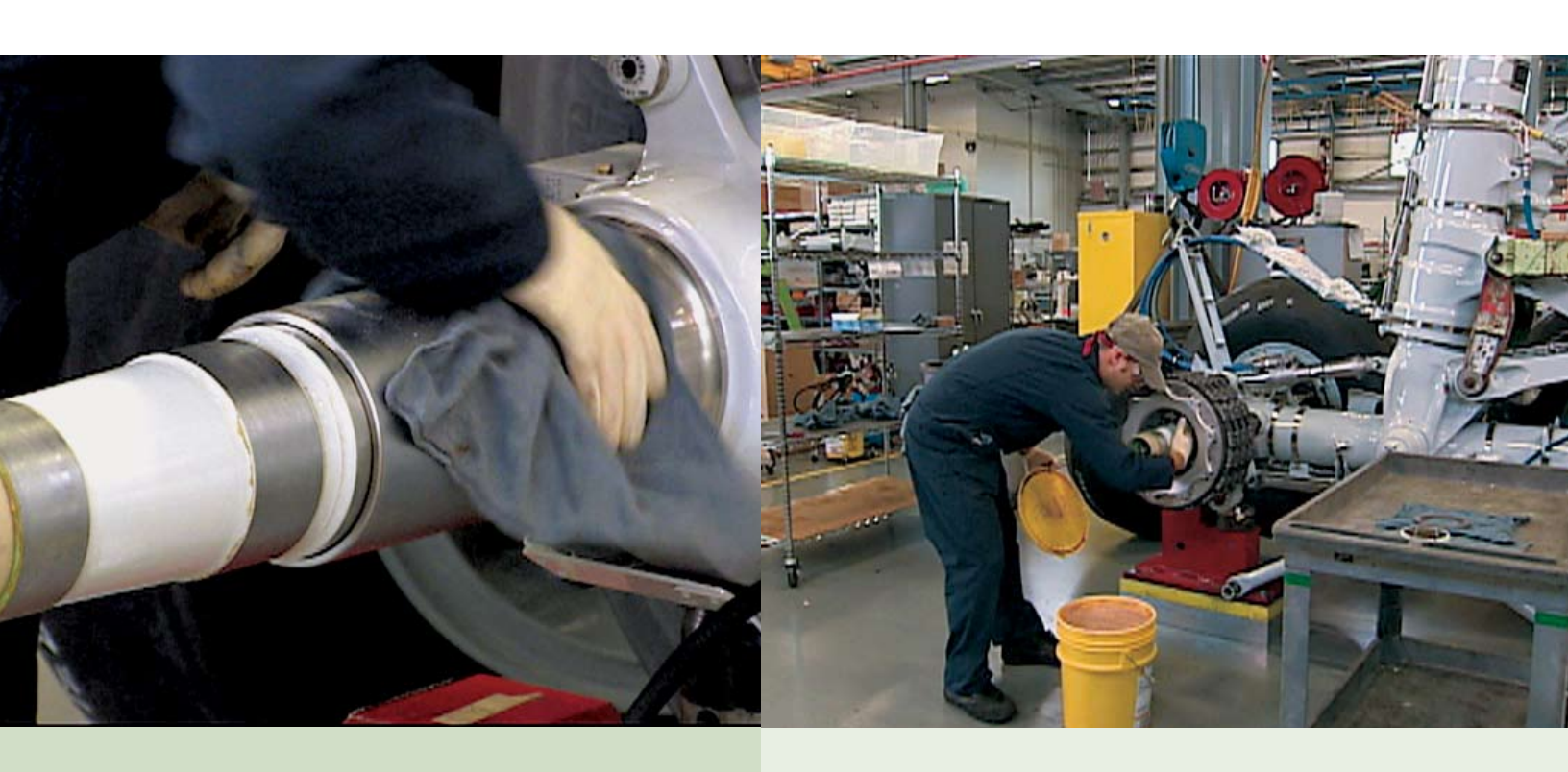
THIN LAYER OF GREASE BEING APPLIED TO BRAKE/AXLE SLEEVES Figure 5\,